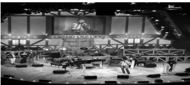
GRAND OLE OPRY