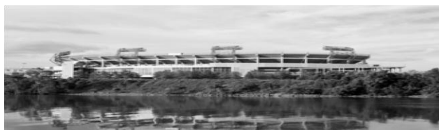
HOME OF THE TENNESSEE TITANS