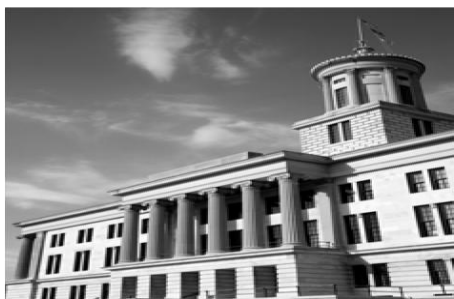
STATE CAPITAL BUILDING

John A. Gupton College is nestled in the middle of downtown Nashville, just minutes from many of the cultural attractions that make Nashville a great city. Nashville, with its beautiful skyline, the state capital, convention center, museums, and Riverfront Park, offers many features enjoyed by all ages. Music Row, the Grand Ole Opry, and the world-renowned General Jackson Showboat are just a few of the reasons Nashville is known as Music City U.S.A. Nashville is the home of numerous sporting events such as the National Football League “Tennessee Titans” and the National Hockey League “Nashville Predators” just to name a few.