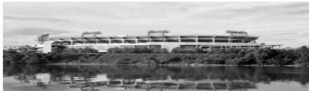
HOME OF THE TENNESSEE TITANS