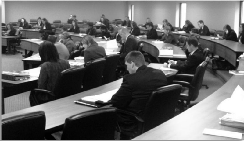
YATES LECTURE HALL

Students must have obtained a cumulative 2.0 grade point average in order to meet graduation requirements. The cumulative grade point average is determined by dividing the total number of quality points by the total number of hours attempted. When failed courses are repeated, only the highest grade will be used in determining the grade point average, and hours attempted will be used only once.