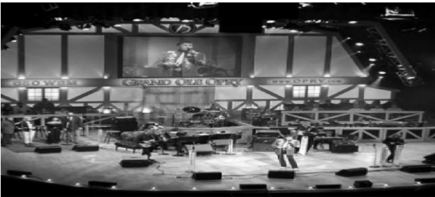
GRAND OLE OPRY