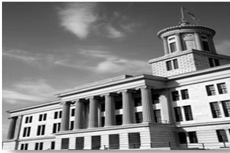
STATE CAPITAL BUILDING

John A. Gupton College is nestled in the middle of downtown Nashville, just minutes from many of the cultural attractions that make Nashville a great city. Nashville, with its beautiful skyline, the state capitol, convention center, museums, and Riverfront Park, offers many features enjoyed by all ages. Music Row, the Grand Ole Opry, and the world-renowned General Jackson Showboat are just a few of the reasons Nashville is known as Music City U.S.A. Nashville is the home of numerous sporting events such as the National Football League “Tennessee Titans” and the National Hockey League “Nashville Predators” just to name a few.