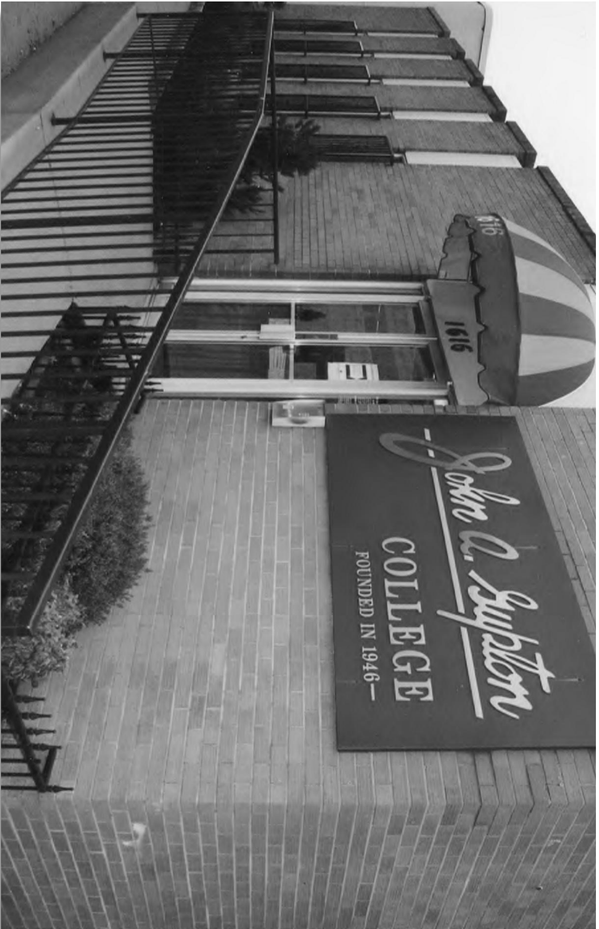
JOHN A. GUPPTON COLLEGE