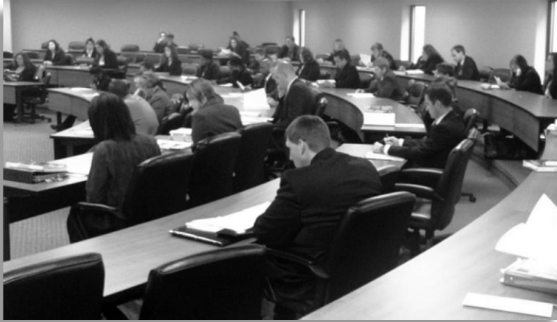
YATES LECTURE HALL

Students must have obtained a cumulative 2.0 grade point average in order to meet graduation requirements. The cumulative grade point average is determined by dividing the total number of quality points by the total number of hours attempted. When failed courses are repeated, only the highest grade will be used in determining the grade point average, and hours attempted will be used only once.