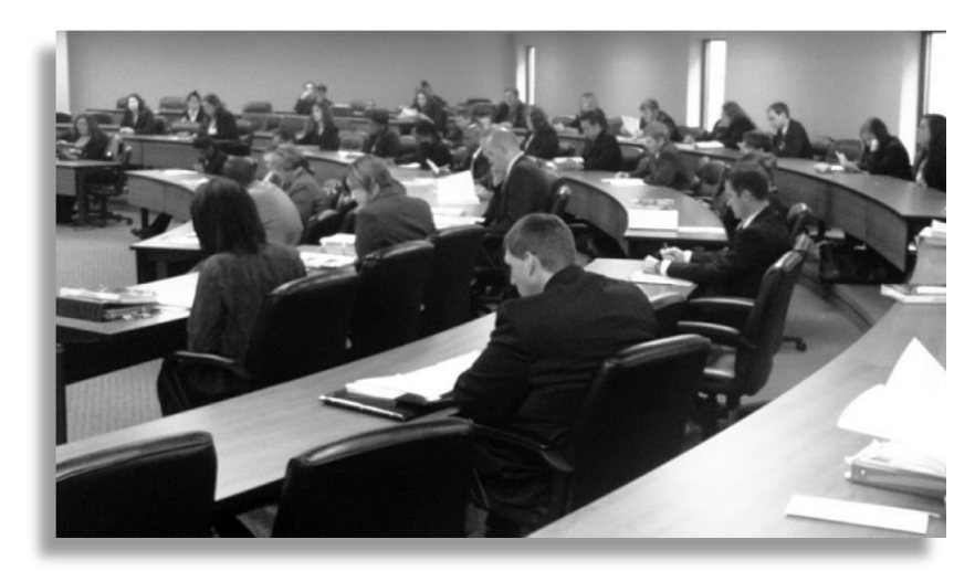
YATES LECTURE HALL

Students must have obtained a cumulative 2.0-grade point average in order to meet graduation requirements. The cumulative grade point average is determined by dividing the total number of quality points by the total number of hours attempted. When failed courses are repeated, only the highest grade will be used in determining the grade point average, hours attempted will be used only once.