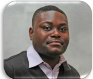
2nd Vice President