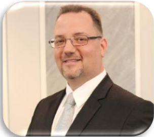
1st Vice President